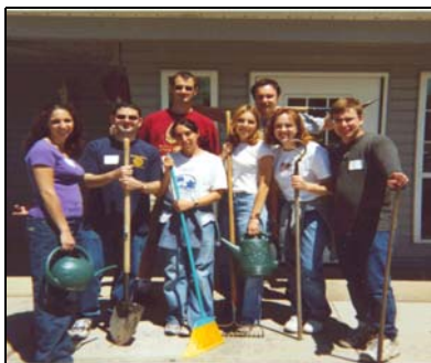
University of Rochester students help out at West Town Village during Senior Wilson Day 2001.