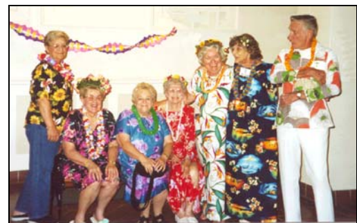
Clemens Manor tenants gather for Hawaiian potluck September 2001.