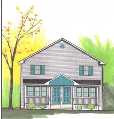
Providence's newest project, Near Westside Apartments , City of Rochester — affordable housing for families—to be built in 2002.