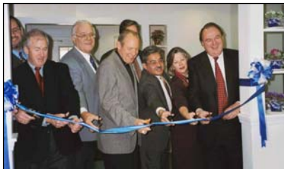
Partners celebrate the opening of West Town Village , affordable housing for seniors in West Henrietta, December 2000.