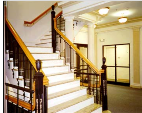
Stairwell, Elizabeth Blackwell Apartments