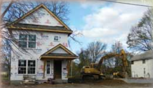
On left: One of the 25 single-family homes being built in the Edgerton neighborhood.