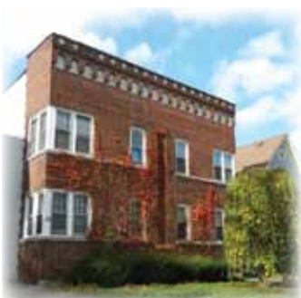
Rivendell Court Apartments is 19 units of permanent supportive housing in three buildings in the City of Rochester.

In February 2012, Federal Home Loan Bank of New York Affordable Housing Program, through member bank First Niagara Bank, N.A. granted a subsidy award in the amount of $300,000 to Providence Housing for Rivendell Court Apartments to complete much needed rehabilitation work.