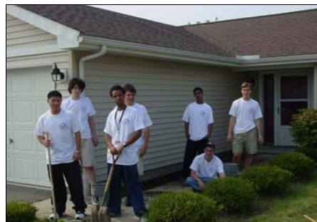
University of Rochester freshmen garden at Union Meadows on Wilson Day, the University's social service work day.