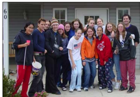
Members of the East-SOTA Swim Team performed community service at West Town Village this fall.