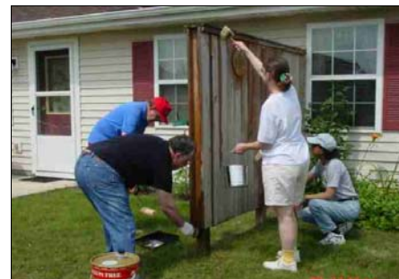
Volunteers from St. Margaret Mary Social Ministry spruce up the divider fences at Union Meadows this summer.